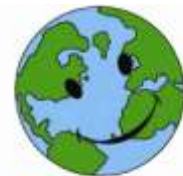
Earth Day Festival