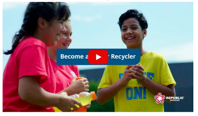
Check out this 1:35 minute video outlining the changes.

Videos not your thing? Read about our recycling options on this webpage <u>here</u> that examples and suggestions for proper recycling like how to recycle for a sustainable future. You will... Know what to throw - paper, cardboard, metal, and hard plastics ... Learn how to recycle electronics, batteries, light bulbs, and plastic bags ... Understand that all items must be empty, clean, & dry. Don't bag your items.