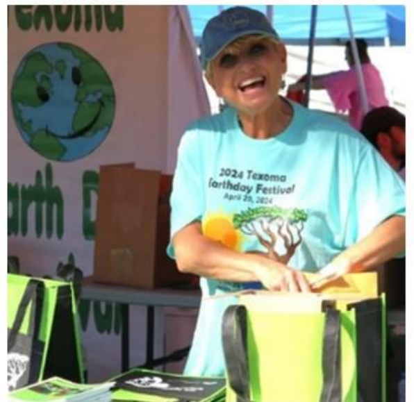
Earth Day Images June 15, 2024