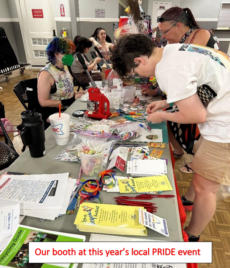
Our booth at this year's local PRIDE event